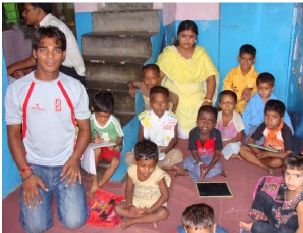
VRF kids in school along with teachers