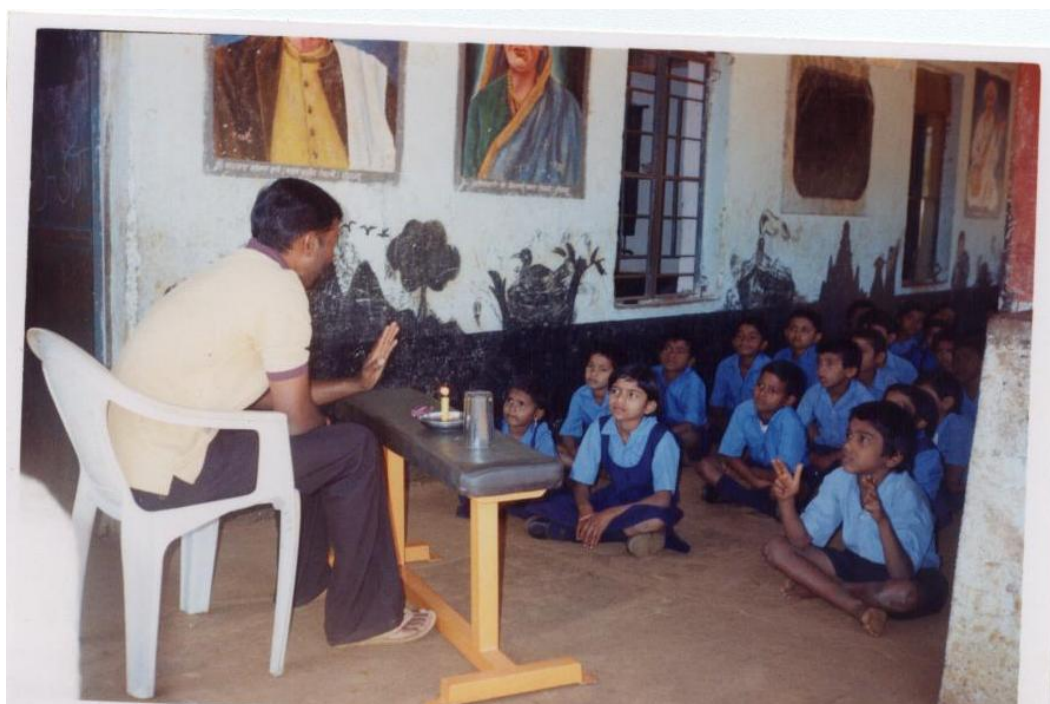
Raiwada students doing experiments in class