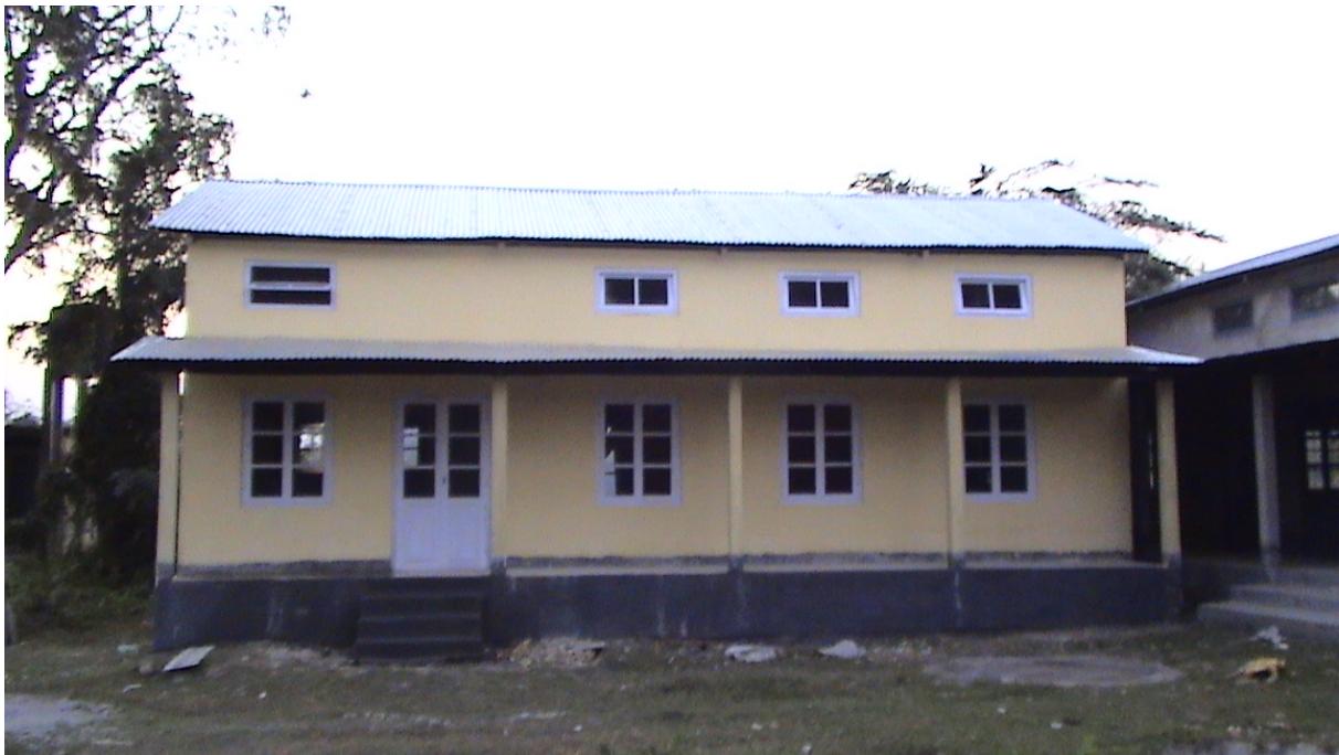
Finished building of the School

We continued our collaboration with Debendra Nath Acharya Charitable Trust to finish the construction work started last year in the GU Model Lower Primary school. With additional facilities, school intends to provide education to more kids from the neighbourhood areas. This year we provided the support of 2500 Euros to finish the remaining work for additional facilities.