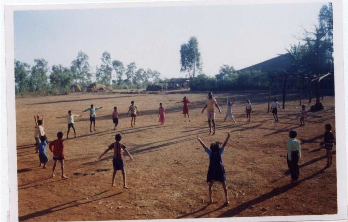
Raiwada Students doing exercise in the ground