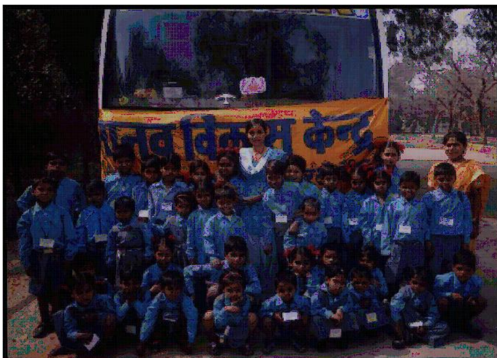
VRF Kids during a school trip to Delhi Zoo

We continued our collaboration with VRF to spread the word of education amongst children living in slum of Wazirpur Industrial Area in Delhi. With a preparatory school, VRF prepares the slum children for admission to neighbourhood Municipality schools. In year 2008, VRF was helping around 60 students to get into main stream education. To continue the effort, this year we provided the support of 1900 Euros to take care of the running costs of this noble venture.