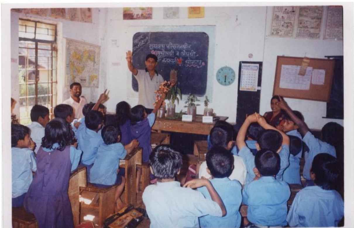
Classroom in Raiwada school

This school is situated in Raiwada, around the hilly region about 7 kms away from Ajra (Dist. Kolhapur). Raiwada is a rehabilitated settlement of tribes and other people who were affected through the construction of the Chitri dam. The school was started by Tukaram Educational Centre with initial fixed funding from few students who were from that region. After utilising all the initial funds they were not able to continue the school properly. Under these situations, Asha Munich agreed to fund regular expenditure for one year and work closely with the Society for promoting Participative Ecosystem Management in India to make it sustainable in long run. In year 2008, we provided the support of 1000 Euros to take care of the running costs of this school.